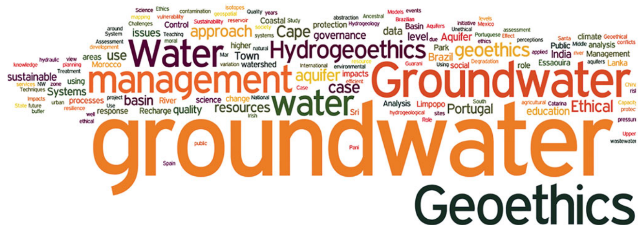
Fig. 2 Word cloud based on all abstracts of the special volume on “Advances in Geoethics and Groundwater Management: Theory and Practice for a Sustainable Development” (generated using http://www.wordle.net/ )