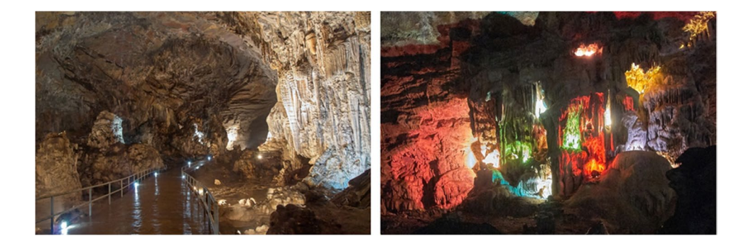
Fig. 8 Example of replication of cave. Cacahuamilpa Cave, the most visited cave in Guerrero (Mexico), discovered in 1883 and with about 350.000 visitors per year (Palacio-Prieto and Gómez-Aguado de Alba 2014), is part of the Grutas de Cacahuamilpa National Park, one of the largest cave systems in the world

(and types of public, e.g. students, children, adults, disabled people) as possible, allowing all the society to have an underground experience of high rarity? Or should it be kept instead in the most natural state possible, limiting its accessibility and use to a smaller group of visitors? While the former requires an artificialisation of the cave for its utilisation and development, the latter implies a more realistic experience to visitors and causes much less impact in geo- and biodiversity. As with most other classes of geological heritage, prior to the decision, it is necessary to put into practice geoethics values in order to achieve a balance between tourism development and protection of the caves.