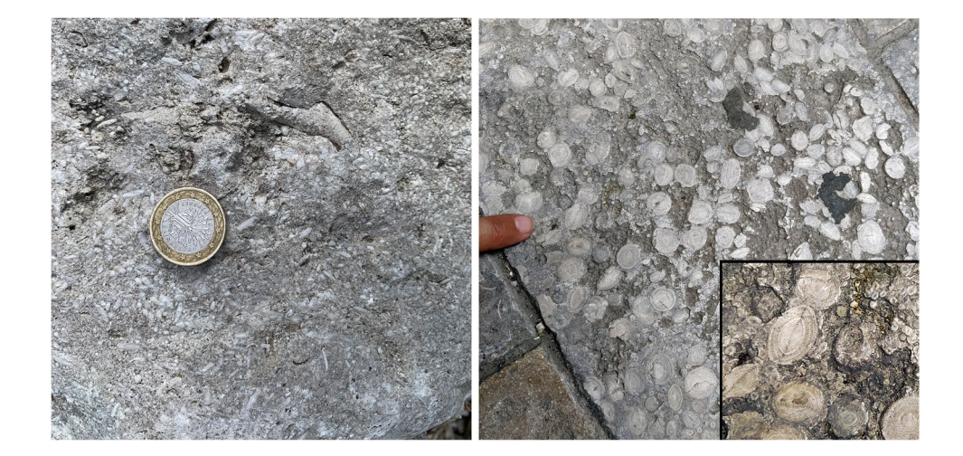
Fig. 2 Example of foraminiferal assemblages in ornamental limestones. Alveolinids (left) and Nummulites (right)

In terms of regulations, and because palaeontological heritage is considered as a type of heritage in many countries,