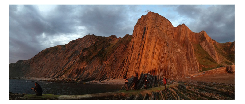
Fig. 7 The Zumaia section in the Basque Coast UNESCO Global Geopark (North Spain). Example of cumulative impact of researchers and visitors on a reference section for the Cretaceous and the Paleogene.