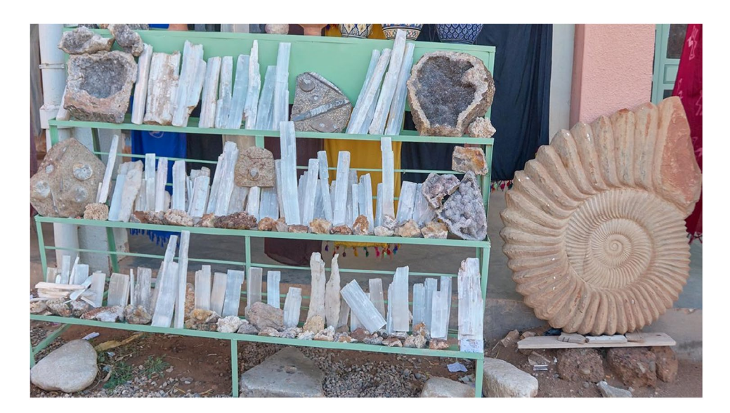
Fig. 3 Traditional selling of minerals and fossils. The "giant ammonite" can be considered as an example of traditional local handcraft in Morocco (North Africa)

participation of for-profit professional sellers who display and sell beautifully preserved specimens (Fig. 4).