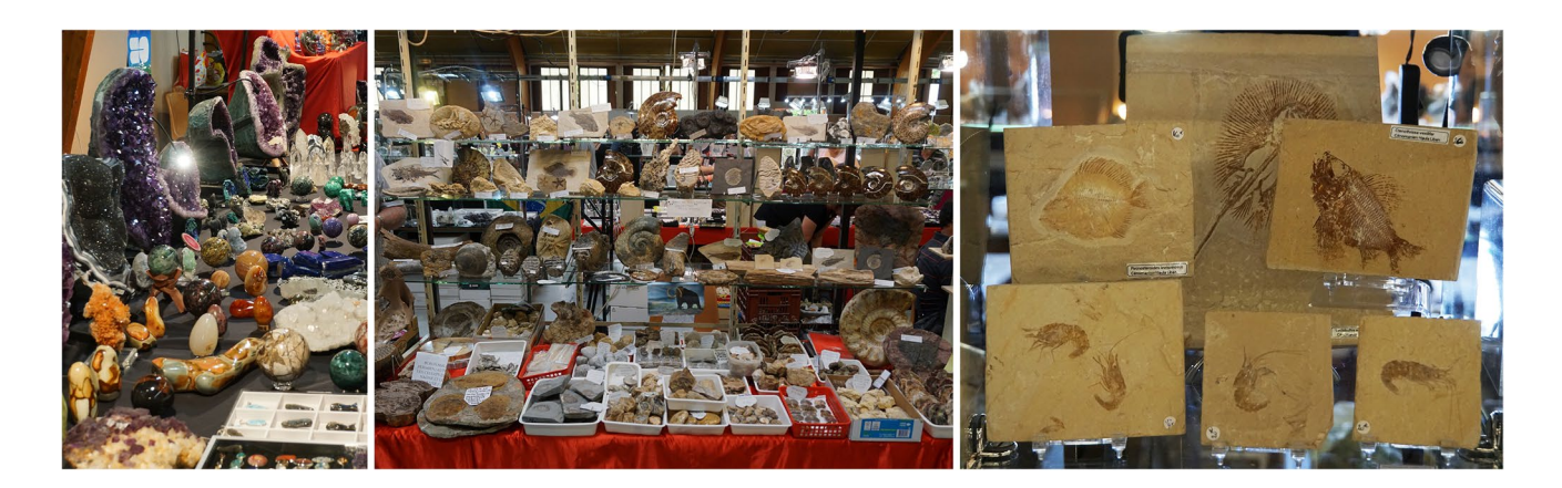
Fig.4 Example of international fair displaying a variety of mineral and fossil specimens to sell. Bourse aux Minéraux et Fossiles de Millau (France) 2016.

Commercial collecting and the market in fossils (and other geological specimens) is one of the most complex aspects affecting geological heritage (Page 2018) and raise many interesting observations. Indeed, there is a dichotomy of views in the professional or academic community on this matter which should not be ignored. On the one hand, a benefit of the increasing global market for fossils is that many critically important specimens, especially vertebrates