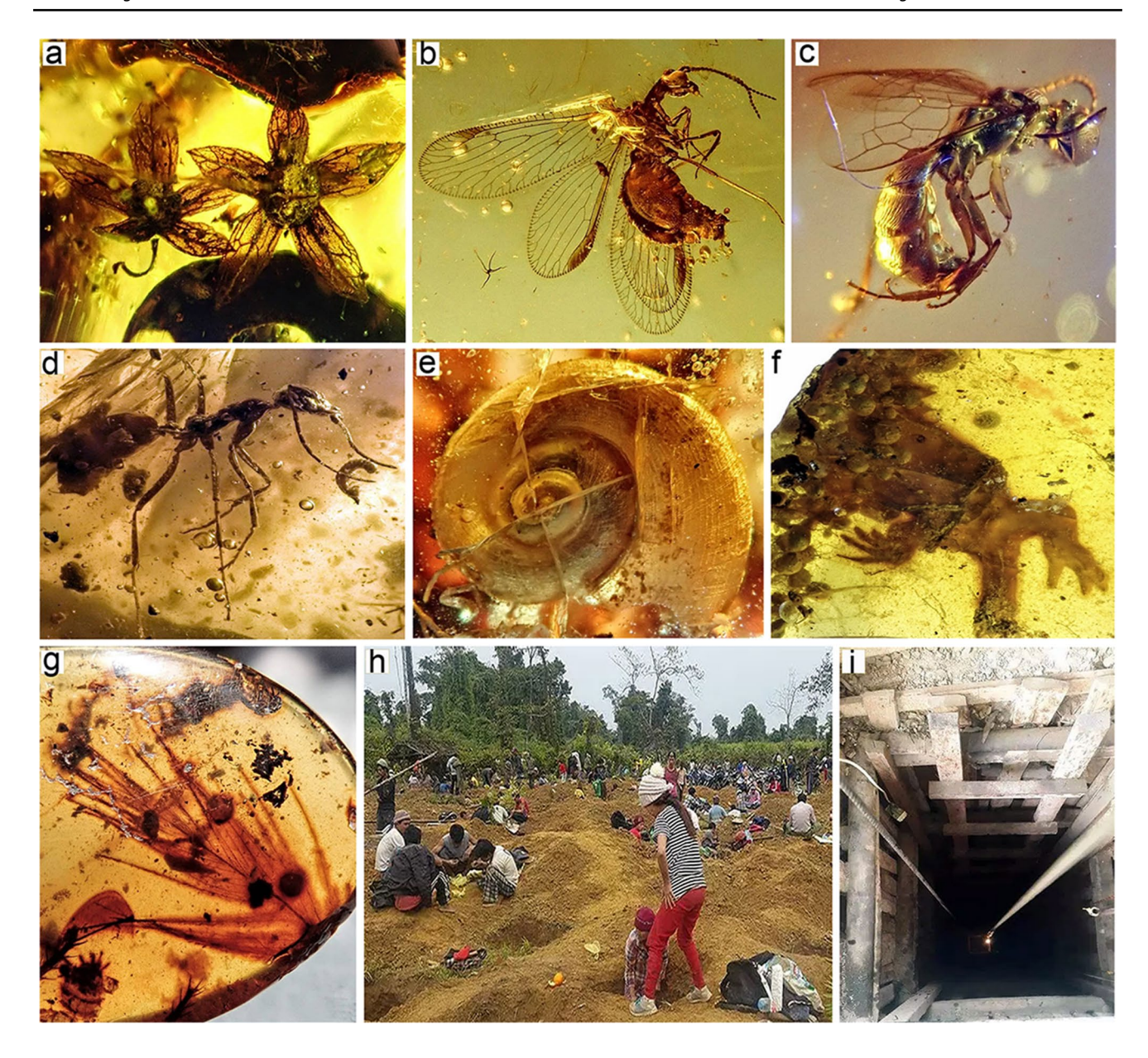
Fig. 5 Example of Mid-Cretaceous Burmese amber and fossils. Extraordinarily preserved angiosperm flowers (a), lacewings, wasps and ants (b-d), snails (e), and vertebrate remains (f, lizard/gecko; and